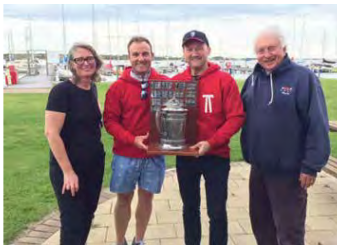
trophy presented to the crew of Mackie