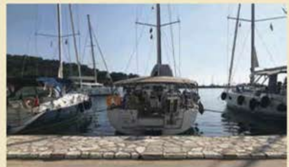
Cruising the Mediterranean from Corfu see page 6