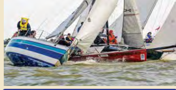
Memories of Milang to Goolwa and Vice Versa see page 15